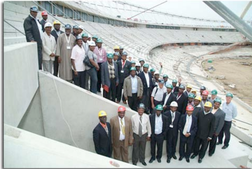
Delegates at the construction site of the Moses Mabhida Stadium