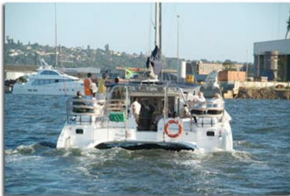
Trip to view Durban Harbour widening project